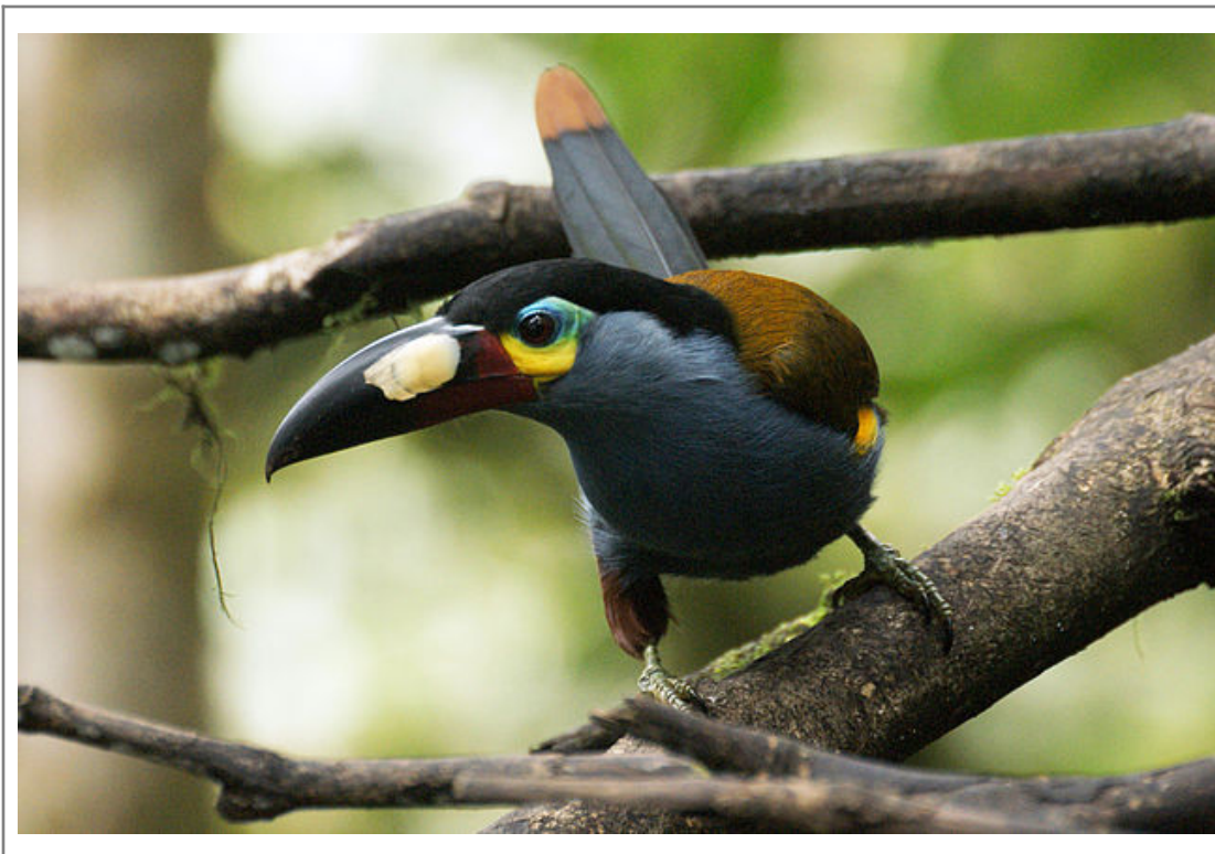
Plate-billed mountain toucan

Listen for the mating duet of this species, which consists of females and males calling to each other with loud rattles and clicks.