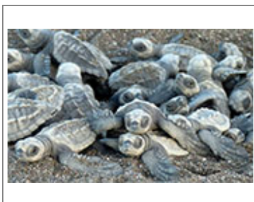
Fun with Turtles in Costa Rica!