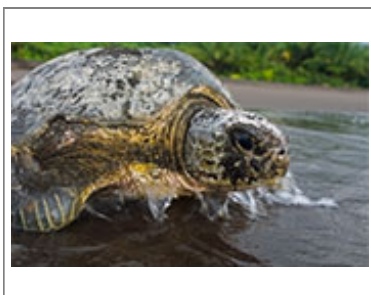
12 Miles of Paradise: Visiting Sea Turtles in Nicaragua